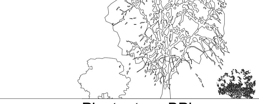
Planter type BPL